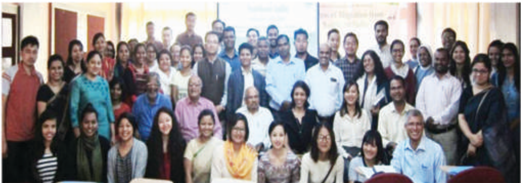
Group photo of Seminar in Guwahati, Assam

Thirteen training programmes, covering 748 migrants, were conducted by the Labour and Migration Unit during the year 2017-18. They were mostly trainings on rights and entitlements, legal awareness, health awareness and on various schemes available to migrant workers. The training programmes encouraged the migrants to organise themselves to demand their rights and entitlements. After the trainings, more and more migrants began to approach the Help Desk of the Unit.