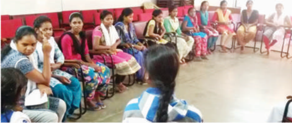
Migrant Tribal Garment workers at ISI-B