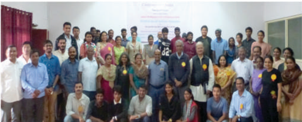
Group photo of Seminar in ISI, Bangalore